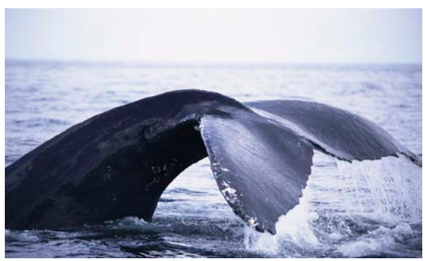
Breaching northern right whale (top photo) and diving humpback whale

To obtain a complete copy of the final rule or the current regulations, please contact Marcia Hobbs (Marcia.Hobbs@noaa.gov, 978-281-9300 ext. 6505) or visit the ALWTRP website.