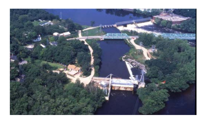
Bar Mills Dam

grounds, such as in the Ossipee River and other tributaries. Shad, alewife and blueback herring also are expected to return in greater numbers